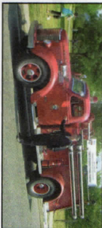
1949 WFFD Pumper.

May Day will conclude with a dance at Caulfeild Cove Hall with the community's popular R&B band, Wednesday @ Ernie's. 🍷